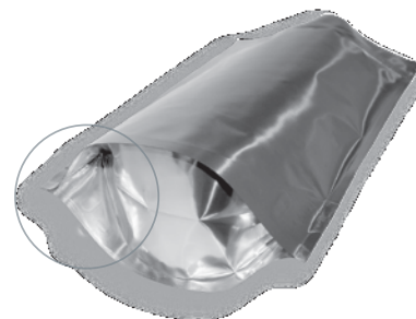
Inserted Bottom Gusset