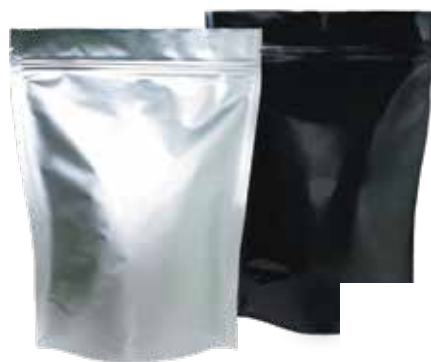
• Front View